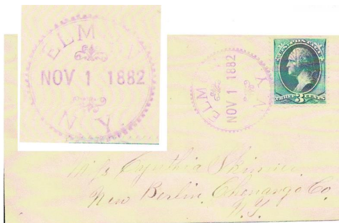
Figure 1. The cover from Elmon with enlarged cancel inset. Elmon was in the town of Winfield in Herkimer County.

Elmon, NY (Herkimer County) (Figure 1) is a post office name that existed for a little more than 4 months (July 11 - November 16, 1882).