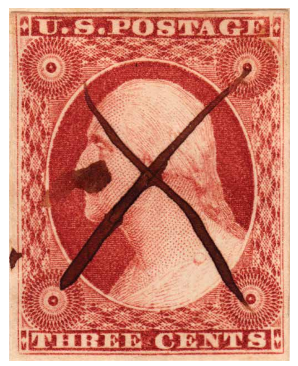
Figure 2. Enlargement of the stamp from the Figure 1 cover. The stamp is a clear, crisp impression, which the author had little difficulty plating to Position 97R1I.

It was fairly easy to identify the position due to the excellent early impression and pen cancel that did not obscure salient details of the stamp. It was only upon closer inspection of the upper right quadrant that I noticed that these extra markings were not as obvious on Chase's plate reconstruction photo—but they are there, proving this was not some random inking variety.