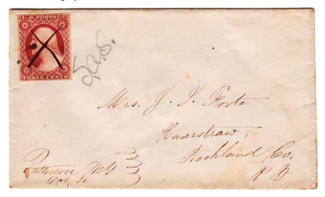
Figure 1. Cover from Patterson, New York, dated 4 Oct (1851) and sent to Haverstraw, New York. The stamp is Scott 10A and shows a newly discovered plate flaw variety.

I plated the stamp as 97R1I (Position 97 from the intermediate state of the right pane of Plate 1) by comparing the on-cover copy to my plate reconstruction, and to the Smithsonian National Postal Museum photographs of Carroll Chase's reconstruction. The stamp is a Relief B example from the bottom or 10th row, with inner line recut at right only. It shows a faint to missing top outer frame line above the "E" in "POSTAGE."