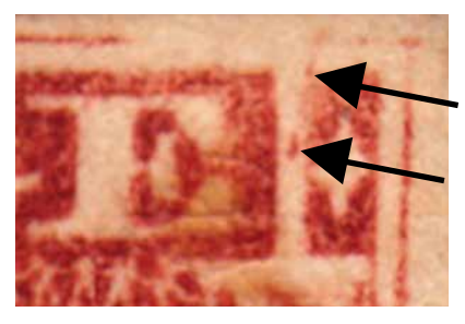
Figure 3. Upper right corner of the Figure 2 stamp, enlarged. Arrows highlight the dash and its follow-on ink trail. The break above "E" in the outer frameline shows clearly.

lower arrow points to the dash and the upper arrow to a portion of the ink trail. I have called this the "Dash and Ink Trail" variety.