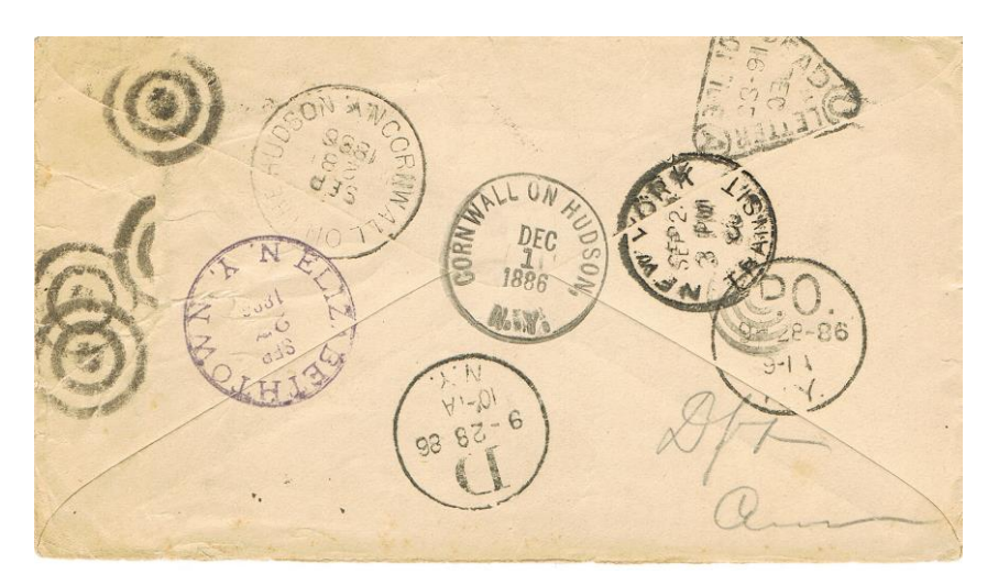
Figure 2. Back of the cover.

For some time the cover went undeliverable and received an "advertised" (Nov 1, 1886) in manuscript. On Dec 15 it was forwarded back to Cornwall on Hudson with new address numbers, but alas, was still undeliverable and went to the Dead Letter Office on Dec 16, 1886. At some point the red "UNCLAIMED" was added.