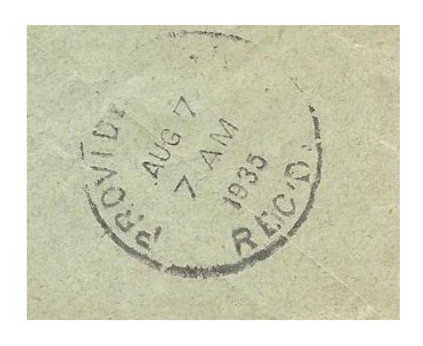
Figure 2. Providence, RI rec. mark

evidenced by the N. Y. Paquebot duplex handstamp. The British stamp was actually a requirement since this all began on a British-flag vessel, either the Cunard White Star liner "Majestic" or the Cunard White