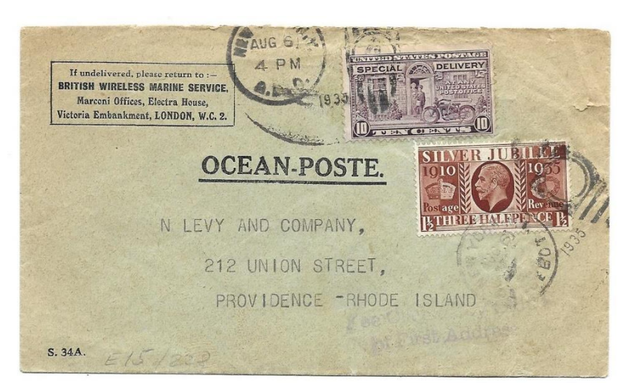
Figure 1. The Paquebot cover as received in Providence, RI.

As collectors, a passing fancy for many of us is the thought of dabbling in the stamp dealing business, either as a professional or, as in my case, a rank amateur merely looking to make a few extra bucks as a means of helping to feed my active collections. This, along with the extra time afforded by retirement has, so far, worked out swimmingly. Not only do you need to purchase huge lots, but better yet, you get first dibs while you get the masses ready for resale. Usually, a bunch of covers immediately get pulled from amongst their compatriots to be placed into their new homes in my albums. More often than not, other covers still in the pile not only stand out for some reason or another, but actually have the audacity to beckon you over. "Start a new collection, start a new topic" these paper sirens seem to screech at you. Sure, it would be easier, not to mention, kind of enjoyable to just keep them all, but you must steel yourself, ignoring their pleas. These covers need to be researched, scanned and listed for sale, this being the entire point of the dealer experience in the first place.