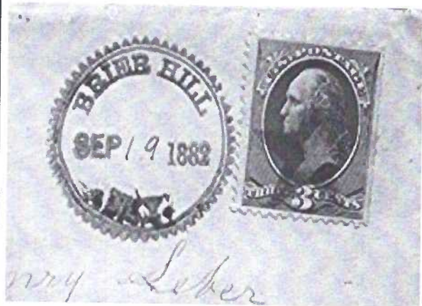
Brier Hill (St. Lawrence County) (1851 - in operation) Blue datestamp and star

Glenn A. Estus PO Box 451 Westport, NY 12993