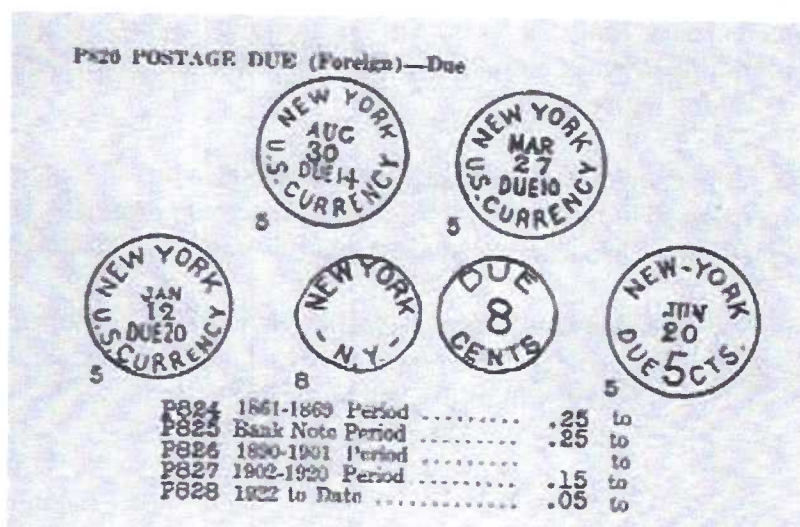
A look back: from General Catalog of United States Postmarks (1st edition, 1935)

There will be an up to date Secretary's Report in the December Bulletin