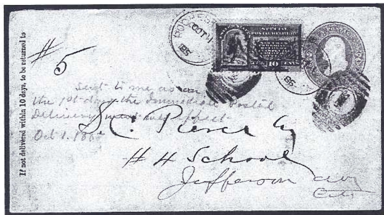
Rochester: First Day of Special Delivery Service, Oct. 1, 1885. According to Scott the earliest documented use is September 29, 1885.

A reminder: each member may use ONE FREE Trading Post Adlet a year