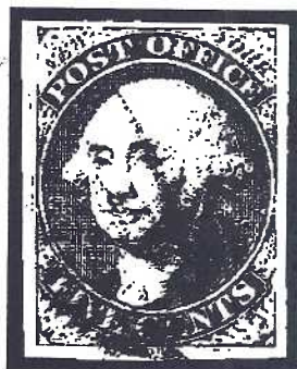
New York Provisional Stamp 9X1 (Lot 12) Schuyler Rumsey Auction Dec. 17, 2003

For information on exhibiting at ROPEX (Webster, NY June 18-20) see article on multi-state exhibiting competition elsewhere in this Bulletin. Other New York postal history exhibiting opportunities in 2004 include OLEPEX '04 , Olean, date to be announced, CNYS&CS 2004 , sponsored by the Rome and Utica clubs, Oct. 8-9 at Turning Stone, Verona, and STEPEX '04 , sponsored by the Elmira Stamp Club, Oct. Oct. 22-23 at Horseheads. Detailed info on these shows will appear in future Bulletins.