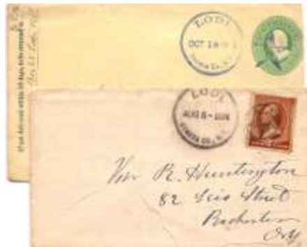
Lot #25 2 different LODI, / SENECA CO., N.Y. county cancels. Blue 1880 "Seneca Co." with large 19mm star; black 1884 "SENECA CO." with star in 16mm circle. ROCHESTER REC'D. on 1884 cover, which is torn open from bottom (letter enclosed). SCHENEVUS / N.Y. CDS on reverse of 1880 cover. Min: $15