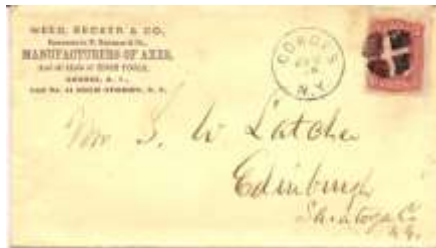
Lot #14 Weed, Becker advertising CC postmarked COHOES/N.Y. (Albany) JUN 18 in 24mm CDS w. neat quartered cork killer to Edinburgh. Clean. Min: $5 WP2