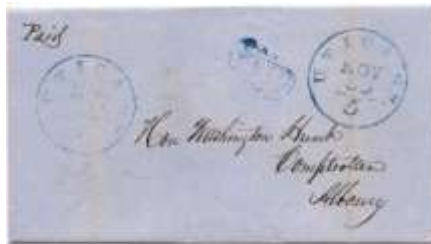
Lot #13 2 strikes of blue UTICA/N.Y. (Onandaga) 30mm Integral-Rate CDS to Albany w. partial blue PAID-in-ribbon and ms. Paid. Docket "Nov 30, 1849 Jno Ballard" on reverse. No contents. Mind: $3 JL2