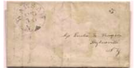
Lot #16 Legible 31mm WARSAW/N.Y. (Wyoming) AUG 30 w. unusual (4x4mm) "5" rate stamp to Strykersville, NY. Full personal letter datelined Middlebury Aug 28 1844 on fine paper with some toning/stain on reverse. Min: $7 JL3