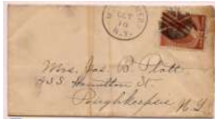
Lot #12 #210 on ladies cover bearing MONTGOMERY/N.Y. (Orange) OCT 18 CDS. Enclosure written on a borrowed form of mourning stationery. Sharply cut cork killer should be submitted to USCC for Whitfield collection. Min: $5 AF5