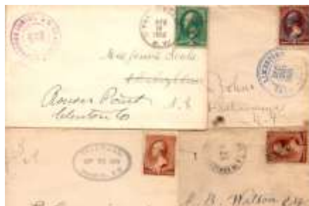
Lot #26 Group of 4 County cancels, all good to fine condition. ELLENBURGH CENTRE, CLINTON CO. N.Y. to forward Plattsburgh, NY April 19 1882 cover (TL); Blue LIMESTONE, CATZ. CO., N.Y. w. duplex negative star in circle Dec 222 1883 cover - roughly handled (TR); Grey-blue CORNWALL, Orange Co., N.Y. SEP 23 1885 serrated oval with star in double circle killer and BROOKLYN, N.Y. RECD on reverse (BL); Weak-at-top NORWICH CORNERS, HERKIMER CO. N.Y. OCT 10 1887 w. 4 ring concentric killer and partial HOMER / N.Y. CDS as receiver. Min: $30 GE5