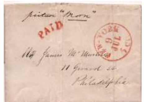
Lot #19 red 29mm NEW-YORK integral 5 Cts CDS ton FLS o Philadelphia. Letter datelined July 8 th 1846, placing this cover earlier than ASCC. Ms. "picture 'Morn'" refers to a painting to be sent later by Adams Express. Min: $4