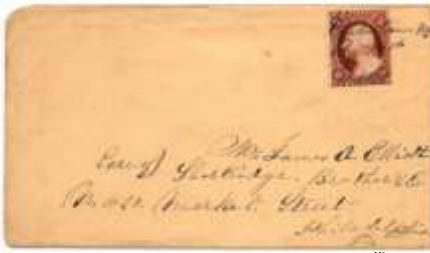
Lot #8 Ms. Coldenham NY/May 28 th /1860 (Orange) over VF #26 to Philly. Opened at left; flap sealed. Later pencil notations mostly erased. Top-left bumped. Min: $5 AF2