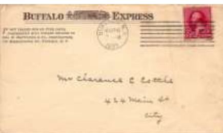
Lot #11 Buffalo Express advertising CC w. #220 (caps on both 2s) canceled by BUFFALO, N.Y. (Niagara) MAR 6 1893 International machine slugged for Station 2 and addressed for local delivery. Clean. Min: $3 WP4