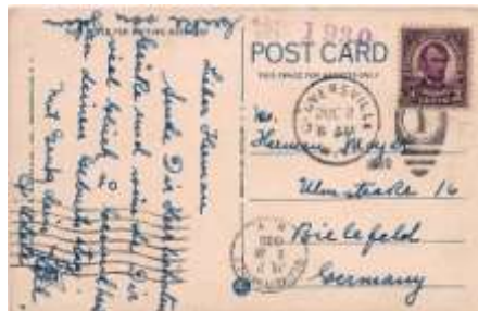
Lot #24 1930 GLOVERSVILLE / N.Y. (Montgomery) to Germany. Machine pass failed to cancel 3° Lincoln (555) so the duplex hand stamp was used. Min: $3 GE3