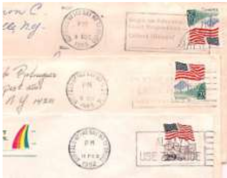
Lot #22 Group of 3 BUFFALO, NY 142 (Niagara) SAY NO TO DRUGS in dial w. slogan cancels: "Begin an Adventure of Giant Proportions – Collect Stamps" w. dinosaur (top); "PLEASE MAIL / EARLY FOR / CHRISTMAS" (middle); "ALWAYS USE ZIP CODE" (bottom). Unopened & fine. Min: $7.50 GE2