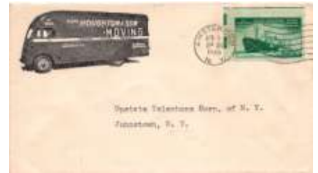
Lot #28 April 1946 AMSTERDAM / N.Y. (Montgomery) Universal machine cancel on Houghton & Son advertising CC to Johnstown, NY. Clean. Min: $3 RB3