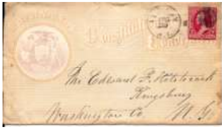
Lot #20 Sc. 220 on State of New York Constitutional Convention "advertising" cover w. 23mm ALBANY / AUG 29 / NY duplex stamper. Reduced slightly at left with a few small stains. Min: $10 WP5