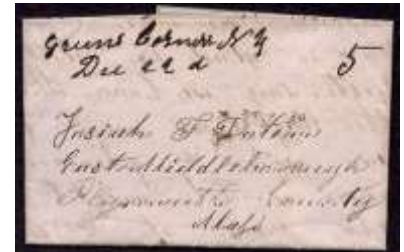
Lot #17 Very small SFL bearing ms. Greens Corners N Y/Dec 22 d and 5 rate to East Middleborough, Mass. This Oneida Co. P.O. opened 1846 and closed 1857 (rarity S/R-7 $100-200). Min: $35 WP3