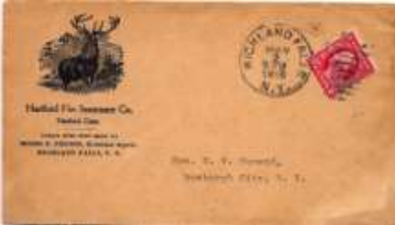
Lot #9 Hartford Fire "Stag" agent CC envelope bears 30mm HIGHLAND FALLS/N.Y. (Orange) MAY 2 3 PM 1915 CDS w/ duplexed killer. Minor water stains on right & reverse; solid otherwise. Min: $3 AF3