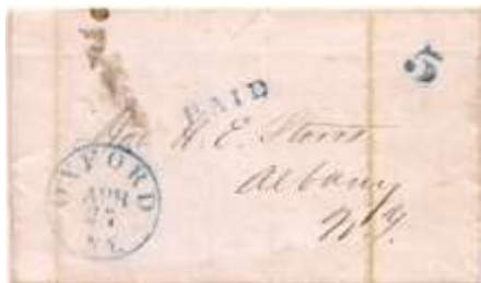
Lot #23 Blue 30mm OXFORD / N.Y. (Chenango) of APR 27 (184?) on FLS to Albany w/o contents. Blue PAID and 5 rate stamps. Ink-blot fingerprints top left. Min: $5 RB1