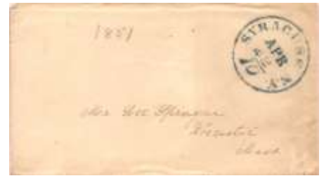
Lot #27 Blue 33mm "date-over-rate" SYRACUSE N.Y. (Onondaga) CDS to Worcester, Ma. Ms. "1851" in line with ASCC. Remnants of sealing wax. Min: $6 RB2