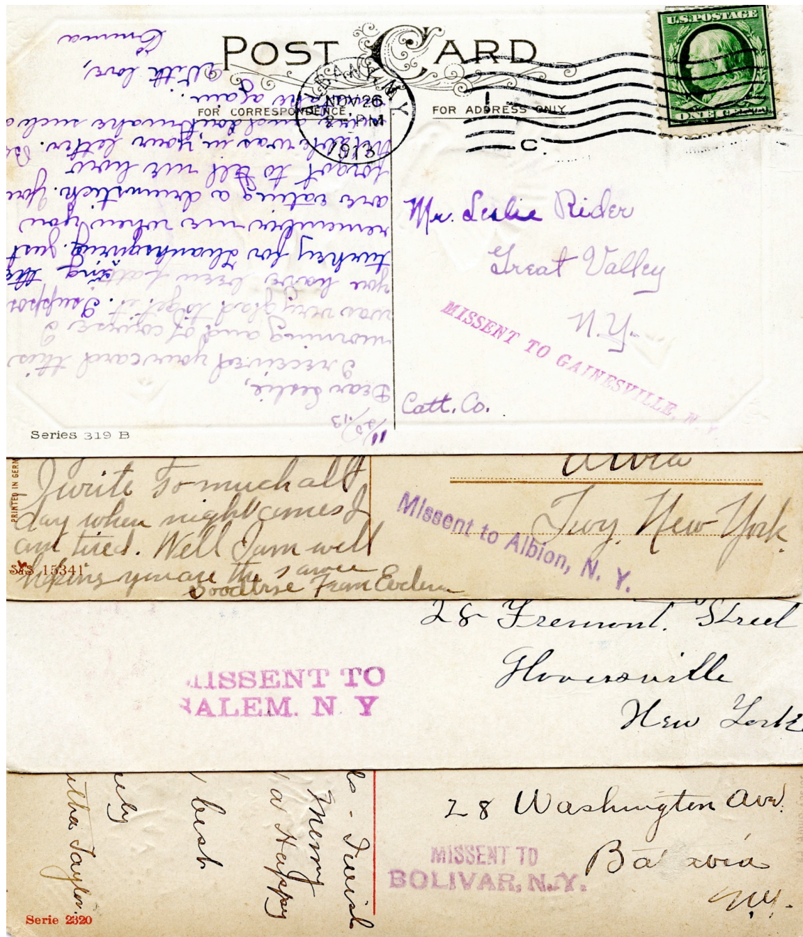
Fig. 3 Post cards missent to, respectively, Gainesville, Albion, Salem and Bolivar, New York. Even we might mistake Batavia for Bolivar.

Perhaps a missent item from New York or Toledo is not very rare, but how about an item missent to a small rural post office?