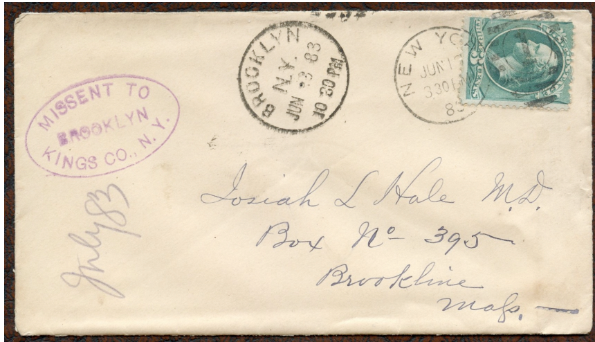
Fig. 1 Letter sent June 1883 from New York to a doctor in Brookline, Mass. Marked the same day in Brooklyn, NY and apparently determined in July 1883 to have been MISSSENT. Or is that a LATER pencil marking? The cover has no markings on its reverse.

As collectors of postal history, we are always seeking new items for our collections. If we find something rare, that is icing on the philatelic cake. I wonder if we are missing something that may be rare, but we have overlooked it?