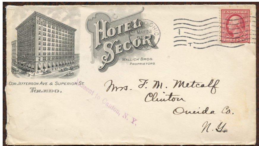
Fig. 2 Letter postmarked May 24, 1909 from Toledo, Ohio to Clinton in Oneida County. The letter bears the violet straight line marking Missent to Canton, N.Y. If you look quickly at the handwritten address, the error in Toledo is not all that hard to understand.

Here in Figure 2 we have no mystery at all. An Ohio rube, not familiar enough with New York counties to think twice, takes the handwritten Clinton for Canton and bags the piece for Saint Lawrence County rather than Oneida. Case closed and 2 extra days for delivery, I would say.