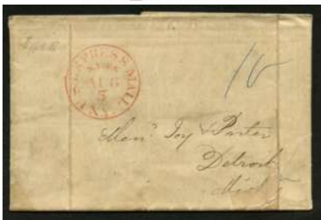
U.S. Express Mail - N. York Cancel

He further details that letters of the 1840's displaying one of these markings are mementos of the long ongoing struggle between the Post Office Dept. and independent mail carriers.