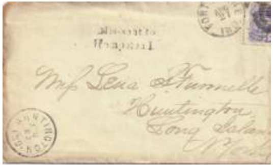
Fig. 1 Fig. 2

There are several reasons for forwarded mail: sender error, like sloppy or incomplete address, could account for the letter going to the wrong Post Office until the postal clerk figures out the correct address (Coram and Comac frequently got each others mail) or the addressee may have moved on and left a forwarding address or returned home. A new Post Office with a similar name to an existing one may occasionally have mail forwarded to it for the first few years of its existence. I have two covers addressed to Smithtown Branch in its first few years of establishment that were forwarded from the Smithtown P.O. only a few miles down the road. Letters addressed to Central Park, NY were a regular source of confusion for postal clerks that were more familiar with the park in Manhattan than the town on Long Island. Letters were missent to the city often enough that the residents of Central Park changed their name to present day Bethpage.