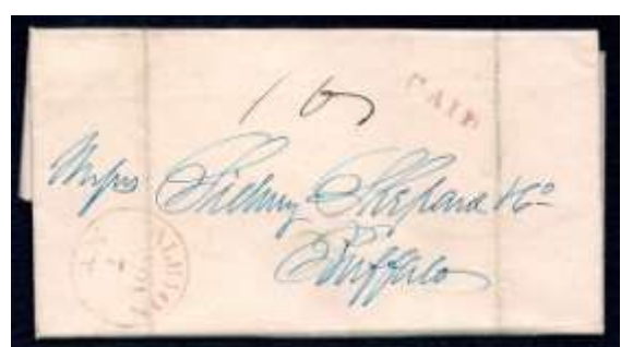
red Albion (Orleans) cds on FLS – faint but legible – 1844 – ms 10; red PAID Comm'l content on good paper, light file folds. Min $

We intend to illustrate every consigned Lot in a two column page format with enough text to describe all markings, including docketing, contents, and condition of paper on a five step scale of Faulty, Average, Good, Very Good, Excellent with faults described. Material with color markings will appear in color. Each Lot that has a reserve set by the Consignor will show the reserve as the Minimum Bid, otherwise the Minimum will be $1. Consignor must supply this descriptive information along with the consigned item and mailing instructions; Auction Administrator will edit submitted information for consistency of required information. See Instructions To Consignors below.