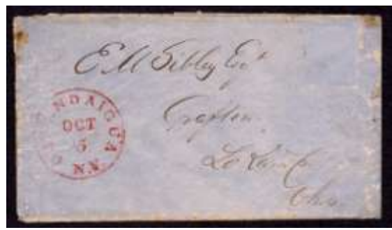
red Canandaigua (Ontario) cds – 1850s? – imperf stamp lost/removed from top right – Avg Ew/oC to Grafton Oh. – few stains & scrapes at right. Min $