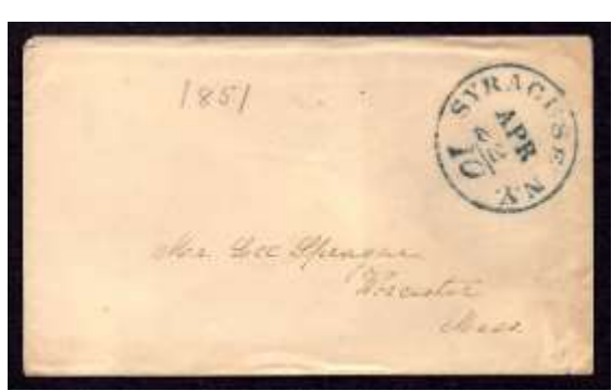
blue Syracuse (Onondaga) integral rate cds – 1851? pencil notation – Good Ew/oC to Worcester, Ma. Min $