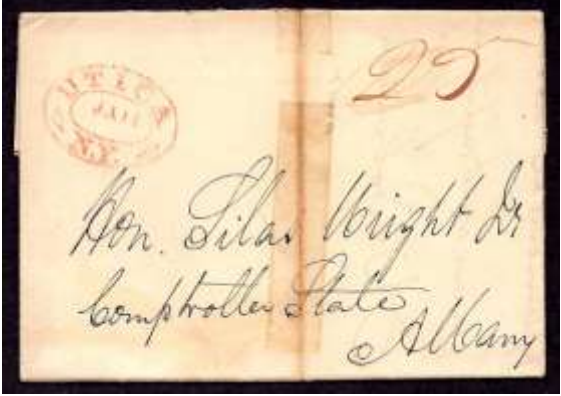
red Utica (Oneida) oval on FLS – 1831 - ms 25 - 2X rate on Faulty paper reinforced with non-archival tape; some tears. Min $

Some abbreviations that will be used include Envelope with content (Ew/C); Envelope without content (Ew/oC); Double rate letter (2X); Triple rate letter (3X); Folded letter sheet (FLS). Any year date not reasonably certain from the postmark or content or docketing will be followed by? Scans by email are free; Copies by mail are $0.50